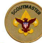
Scouter's Training Award (for Boy Scouts)